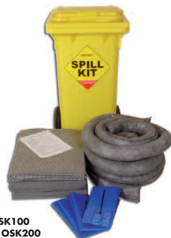
OSK100 & OSK200