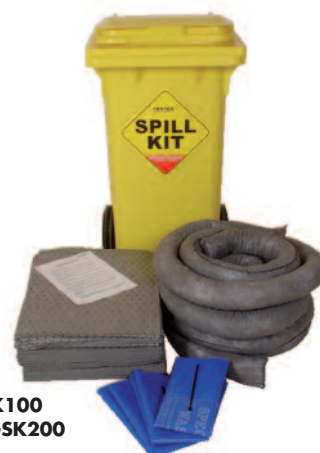
GSK100 & GSK200